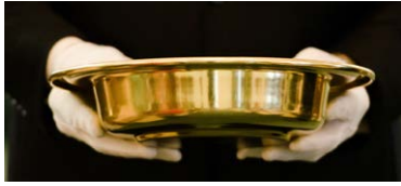
SAINT JOSEPH CATHEDRAL Updated March 11, 2024 2023 Appeal Report

If your Offertory is not made electronically, please use your parish Offertory envelope to thoughtfully, prayerfully choose your gift. In addition, filling out an envelope or electronic statement helps us keep track of who is actively registered at our parish.